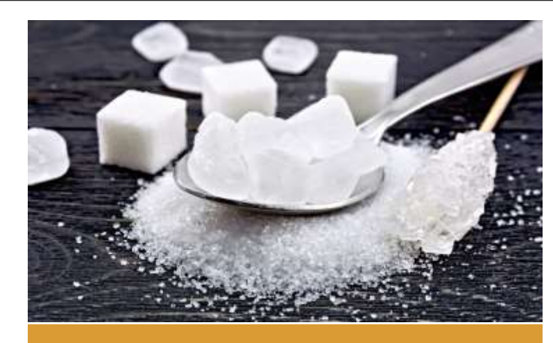
WHITE GRANULATED SUGAR