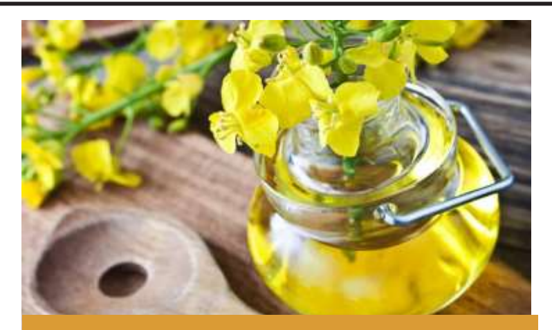
CRUDE RAPESEED OIL