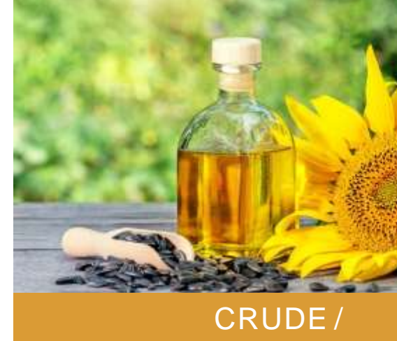
REFINED SUNFLOWER OIL