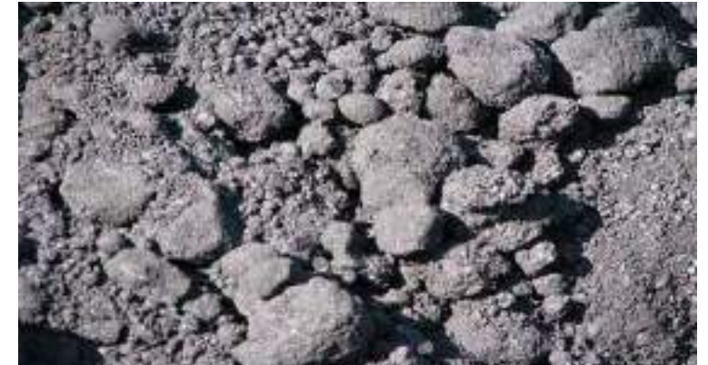
PETCOKE ( Standard & Low Sulphur)