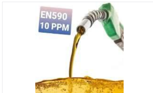
EN590 10PPM DIESEL OIL