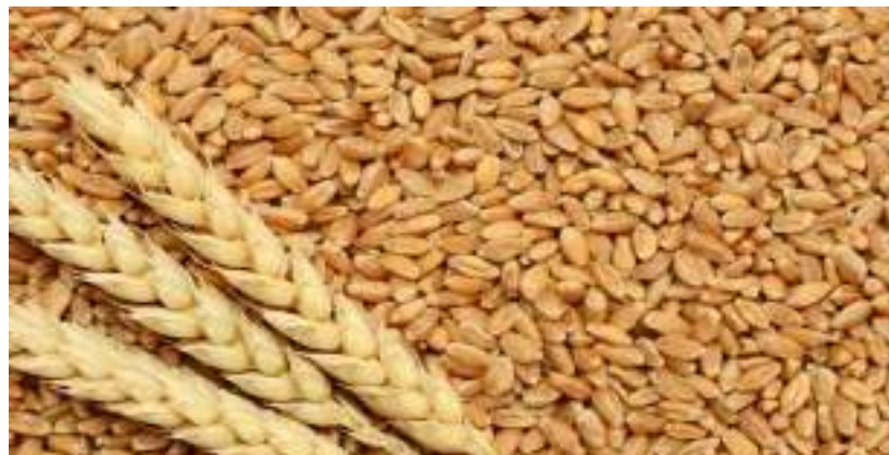
NON GMO SOFT MILLING WHEAT