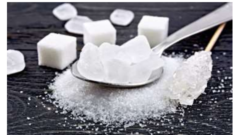
WHITE GRANULATED SUGAR