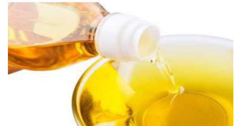
CRUDE CANOLA OIL