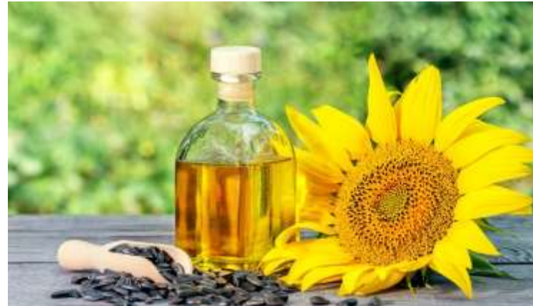
CRUDE / REFINED SUNFLOWER OIL