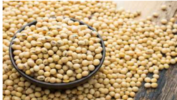
SOY BEANS GMO/ NON- GMO