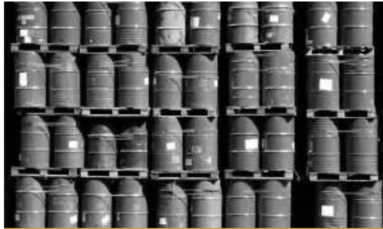
JET FUEL+ OTHERS FUELS