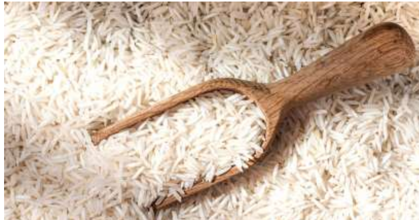
RICE / BASMATI RICE