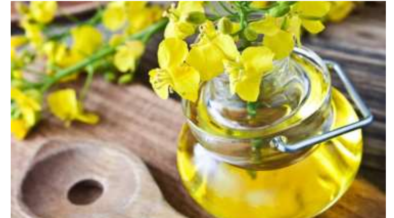
CRUDE RAPESEED OIL